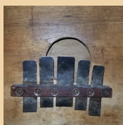
Rumba Box from Jamaica