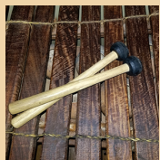
Balafon from Ghana