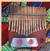
Mbira from Zimbabwe